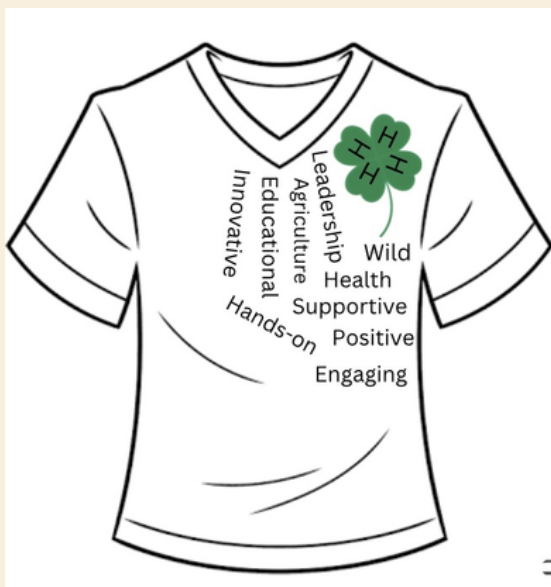
Clover with wording

Please take a minute to scan the QR Code or visit the link to vote on your favorite t-shirt design. Voting will close at 5:00 on March 21st!