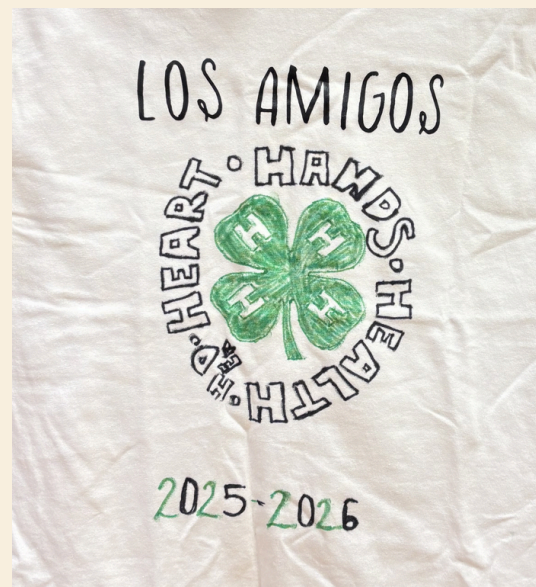
Head, Heart, Hands Health